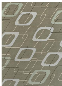
Rugs From Above